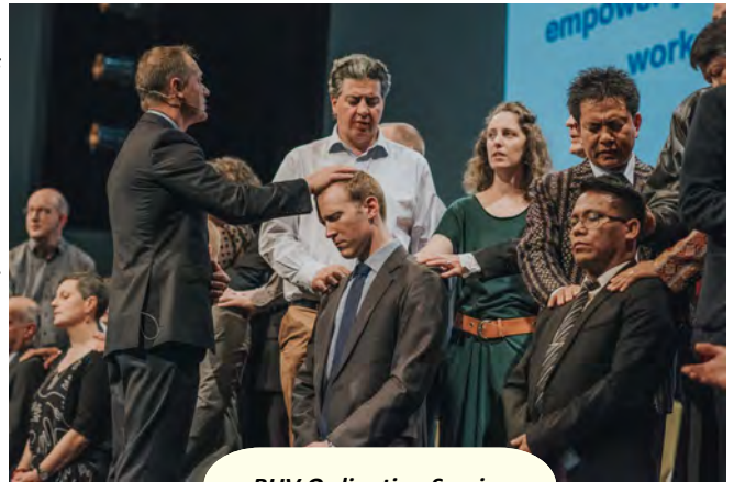
BUV Ordination Service

The BUV has begun a process of looking into topics of Baptist Identity and Freedom of Conscience. These are big topics, and discussion will continue into 2019 and 2020. Pray for wisdom in the BUV as they discern God's guidance regarding these topics. The other big topic for the year is the National Redress Scheme for victims of Child Abuse. The BUV has joined the federal government's Redress program, and now individual churches need to decide whether to "opt in" or not. This will be discussed at our KBC November Annual General Meeting.