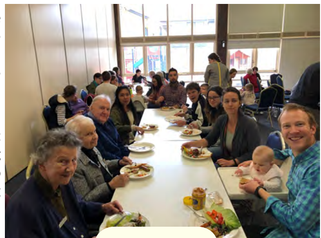
10am Church Lunch