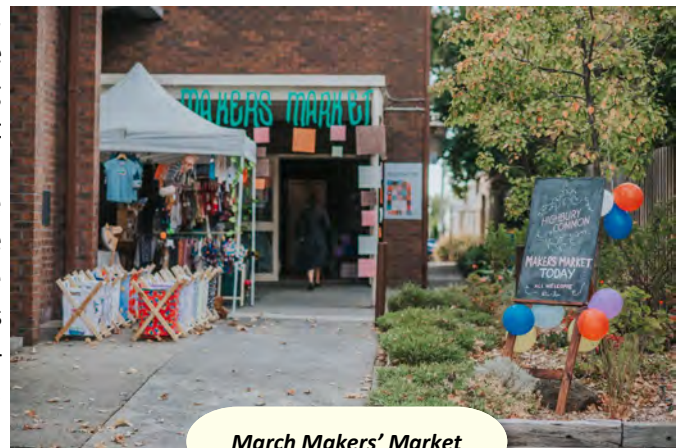
March Makers' Market

At the time of writing this report, the November Market is still a couple of weeks away (Sat 24 Nov), but we've already had an encouraging response; in fact, we've had so many stall-holder applications that we have had to turn people away, which is an amazing problem to have! Please pray for this event as it approaches – for smooth logistics in the final organisational processes, for a strong turnout on the day, and for positive connections to continue to be built in our local community. Please also pray for the future of the Highbury Common Makers' Market as we consider plans for 2019 – for wisdom in decision-making and for personnel to make it sustainable. Sincere thanks to all those who have volunteered their time already to make these events possible!