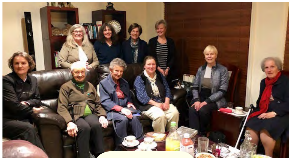
Ladies' Evening Fellowship

The year ahead will continue its format of having a speaker at each meeting but is open to change. Please pray for wisdom and guidance to reach more women and touch each life with God's love.