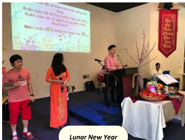
Lunar New Year