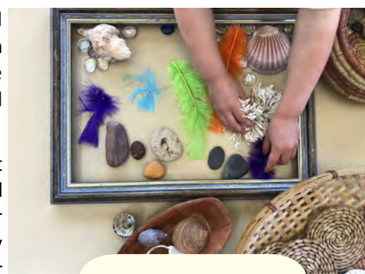
Tea & Tots Activity

For each term throughout the year we have covered a different theme such as 'Nature', 'Transportation' and 'Environments', and focused on a different aspect from these each week. Activities for the morning usually include a craft activity, interactive play setups, storytime and music, and we all enjoy some time together over morning tea.