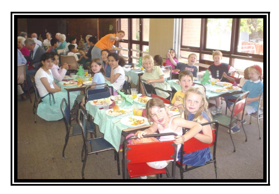
Some of our younger guests!