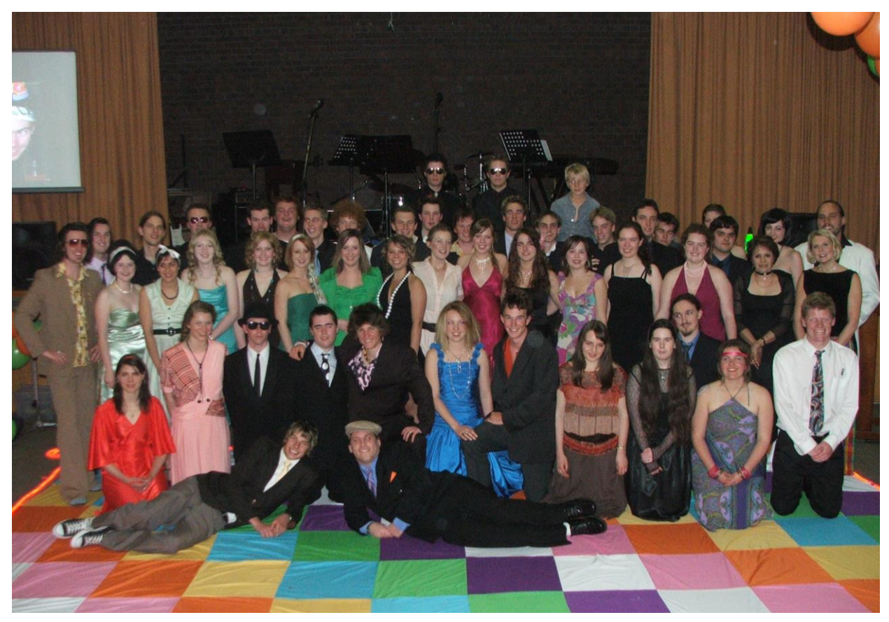
Hostel Formal 2005

There are advantages of not having the Hostel totally full. The dining room at meal times is far less crowded but more importantly it is easier for students to get to know each other and build more meaningful relationships. The atmosphere of the Hostel is fantastic and has a real homely feel. The guys in the house have done a great job interacting with the students and made them feel welcome to drop in and have a chat etc.