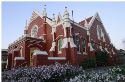
Kew Baptist: Church 158 years of serving Jesus