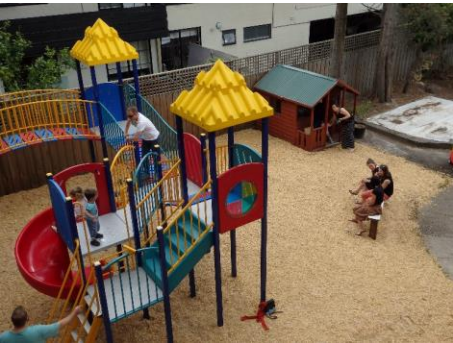
Clockwise from top left: Kids' holiday club, Highbury Common in bloom, Highbury Common playground, Newnham Hall (interior).